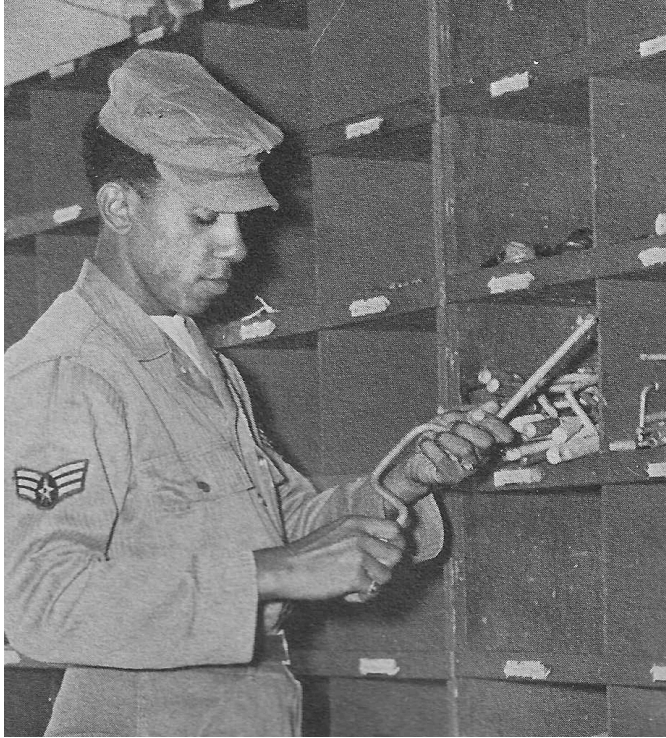
Checking tool bins in the aircraft mechanics supply room.