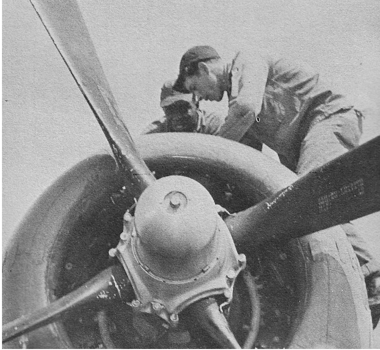
Patching up a fuel leak on a B-29.