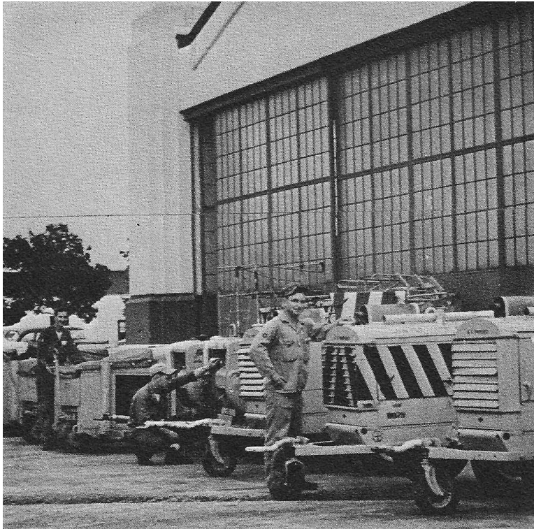
Ground power unit section.