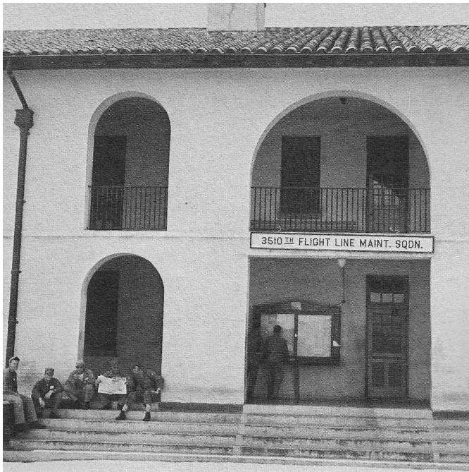
Entrance to the 3510 Flightline Maintenance Squadron building.