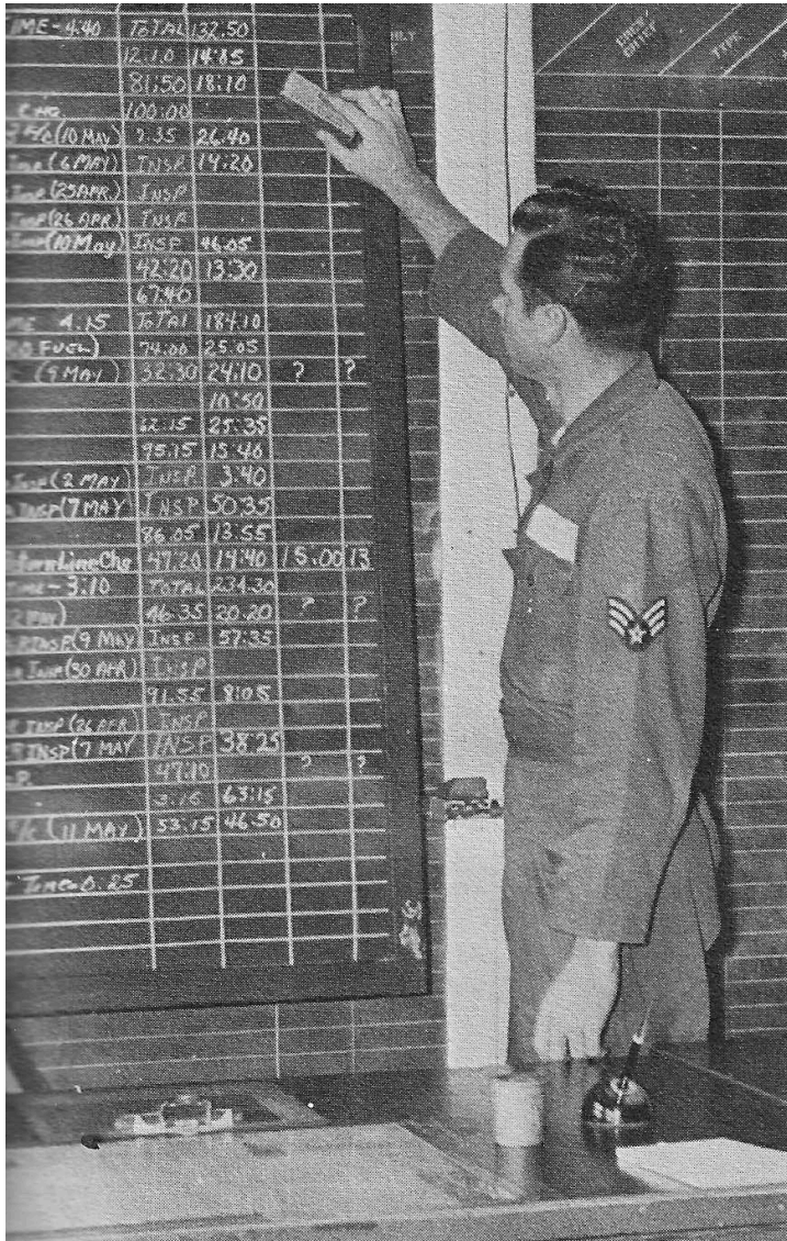
Making a correction on the status board.