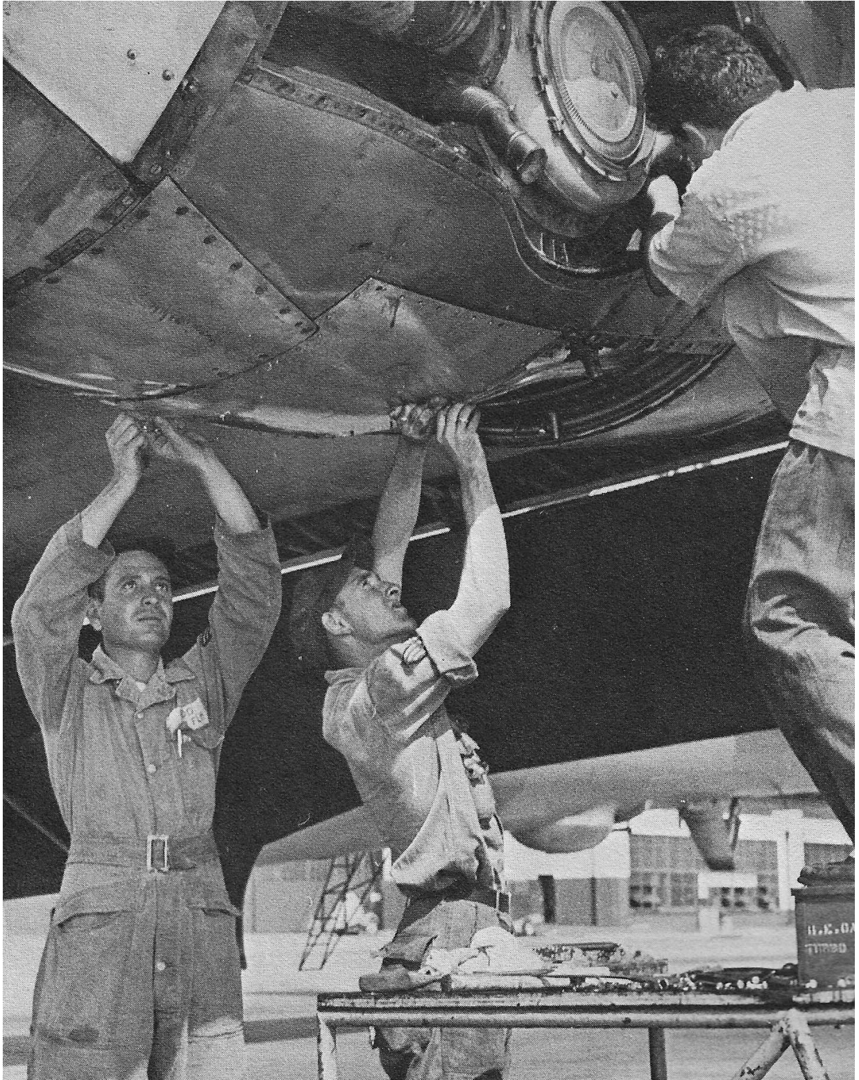
Replacing #1 outboard turbo.